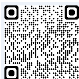
Jolly Phonic songs